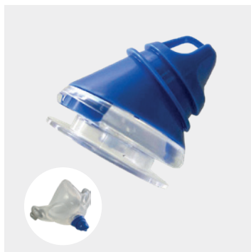
HALF FACE MASK WITH MASK EXHALATION ADAPTOR ATTACHES TO HALF FACE MASK

*Compatible with Cleanspace HALO **Face mask sold separately