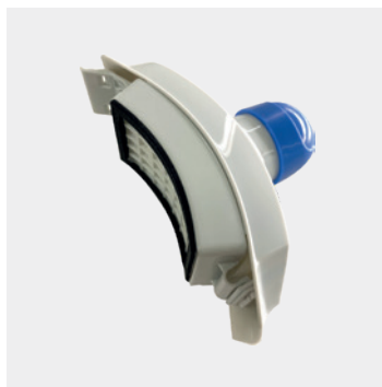
HEPA P3/T3 FILTER WITH HOOD EXHALATION ADAPTOR